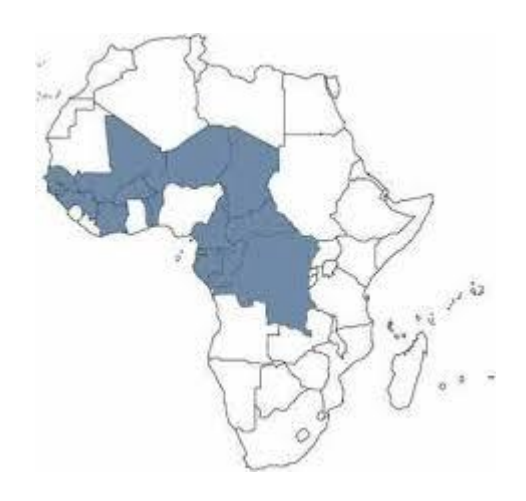
The OHADA Member States

1. OHADA is the Organisation pour l'Harmonisationen Afrique du Droit des Affaires (the Organisation for the Harmonisation of Business LawinAfrica). It was created by a Treaty signed at Port Louis, Mauritius, on 17 October 1993 (hereafter "the OHADA Treaty") following a meeting of the finance ministers of the CFA Franc Zone in 1991. The 14 original Contracting States are Benin, Burkina Faso, Cameroon, Central African Republic, Comoros, Republic of Congo, Côte d'Ivoire, Gabon, Equatorial Guinea, Mali, Niger, Senegal, Chad and Togo. Guinea-Bissau joined in 1994, Guinea in 2000 and the Democratic Republic of Congo in 2012. There are, therefore, currently 17 Contracting States in OHADA. In addition, Nigeria, Sao Tome and Principe, Ghana, Liberia, Djibouti, Ethiopia, Madagascar, Rwanda, Burundi, Mauritius and Cape Verde have expressed an interest in joining OHADA in the future. <sup>2</sup>